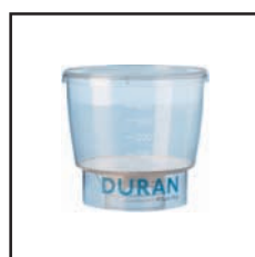
DURAN Bottle top vacuum filtration unit