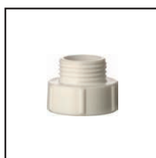
DURAN GL45 Thread Adapter