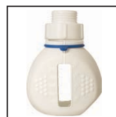
DURAN TILT Protective Light Shield